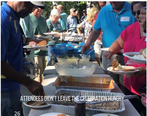
ATTENDEES DIDN'T LEAVE THE CELEBRATION HUNGRY.