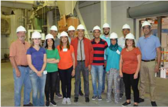
NCI NORTHERN CROPS INSTITUTE TUNISIAN FEED MANUFACTURING - TRAIN THE TRAINERS PROGRAM July 28 - August 7, 2019 | 9 Participants Tunisia