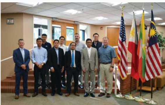
NCI NORTHERN CROPS INSTITUTE SOUTH ASIA CONTRACTING FOR WHEAT VALUE WORKSHOP August 14-20, 2019 | 7 Participants Malaysia | Myanmar | Philippines U.S. WHEAT ASSOCIATES

A comprehensive view of the soybean industry covered uses for soy in both food and feed. This course provided many entrepreneurial opportunities in soy for international as well as domestic participants.