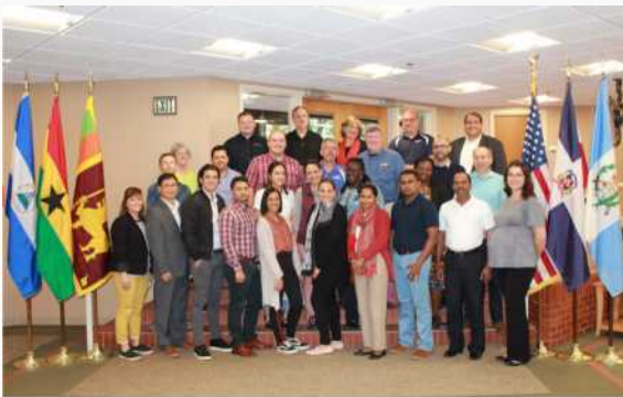
NCI NORTHERN CROPS INSTITUTE NCI-INTSOY August 12-16, 2019 | 20 Participants Dominican Republic | Ghana | Guatemala | Nicaragua | Sri Lanka | USA

This training program, in partnership with the U.S. Grains Council and specifically focused on poultry production, combined in-classroom technical trainings with practical hands-on training at an on-site feed mill, which included state-of-the-art feed manufacturing equipment.