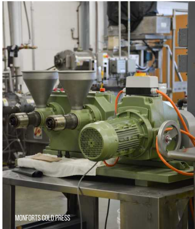
MONFORTS COLD PRESS

The cold press system is designed to press oil from various oilseed crops, including soybeans, canola, flax, sunflowers, and hemp; these oils can also be used to make a wide range of products. The press allows the user to get a first (or raw extraction) that can determine oil yield or used for analytical tests. This piece of equipment comes with different screws and sieves that work for the various crops and also has option to add heat to the press if desired.