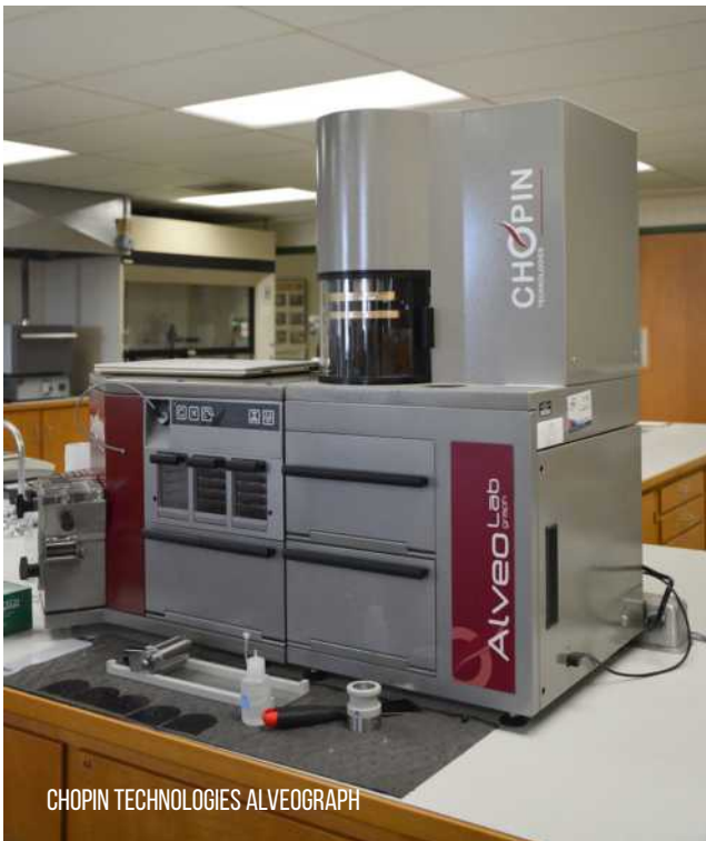
CHOPIN TECHNOLOGIES ALVEOGRAPH

The Alveograph determines the gluten strength of hard red spring wheat flour by measuring the force required to blow and break a bubble of dough. The machine measures both the resistance to stretching and the final size of the bubble. Stronger dough requires more force to blow and break the bubble, while a bigger bubble means the dough has higher extensibility. The process is meant to reproduce the formation of dough when it is subjected to carbon dioxide during fermentation. It is a common test in Europe and parts of Latin America, but becoming more of interest in the US.